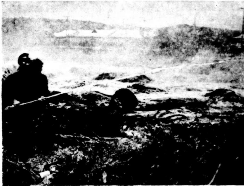
Norwood Rubbish Dump Fire Out Of Control

Firemen playing a hose on a fire in the Kensington and Norwood Council rubbish dump in Sheldon street, Norwood, yesterday, after it had got out of control and threatened to spread to homes adjoining the dump. The outbreak was controlled without serious damage.